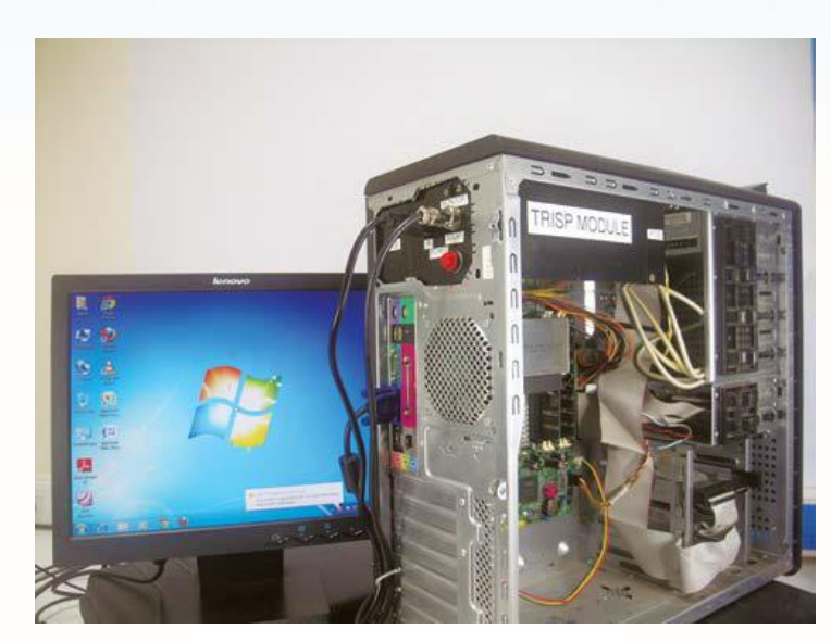
TRISP POWERED DESKTOP PC