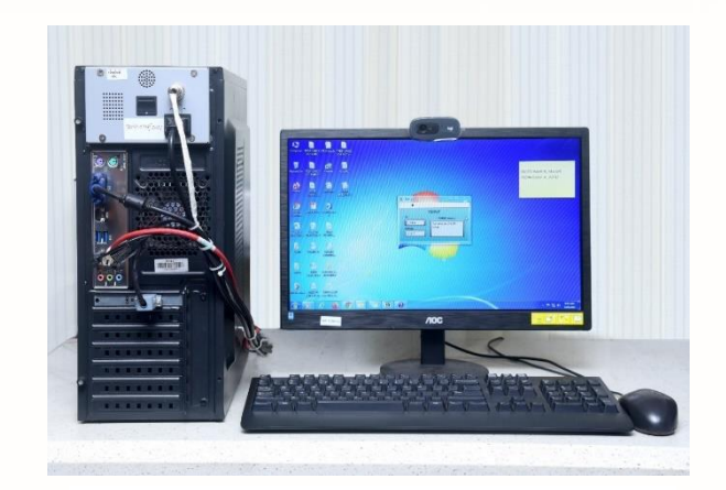
TRISP POWERED DESKTOP PC

USA, CANADA, Singapore and South Africa have granted patents and patent applications are filed in Japan, Europe and India are in its final processing stage.