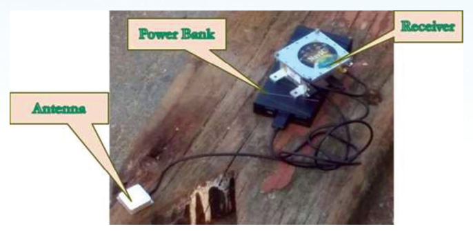
NavIC Messaging and Positioning Receiver Setup with power bank and Antenna

Above figure shows set up of receiver which has external antenna and it is drawing power from power bank. The receiver has been developed, tested, demonstrated and delivered to many users. An Android application is also developed to display the messages on Mobile phone / tablet. Messages broadcasted by INCOIS can be received using this application.