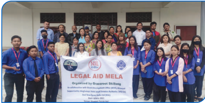
Legal accessibility services for Women in Shillong