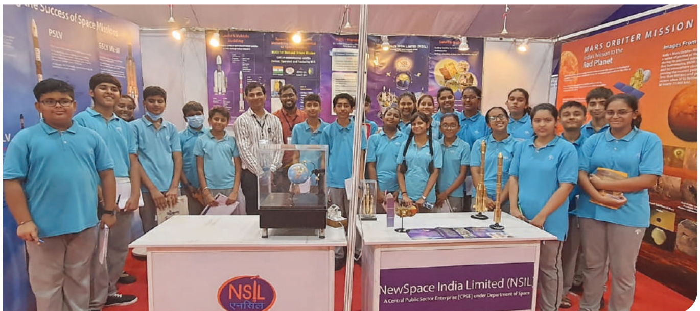
GARAVI GUJARAT 2022 (8 - 10 JULY 2022)

Company's business operation under various business verticals has been addressed under Review of Business in the Directors' report.