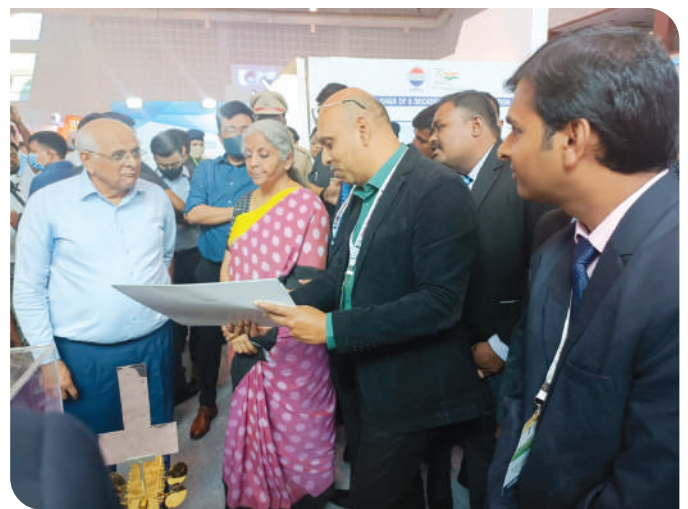
CMD, NSIL briefing Shri Bhupendra Rajnikant Patel, Hon'ble Chief Minister, Gujarat and Smt. Nirmala Sitharaman, Hon'ble Minister of Finance about NSIL at exhibition in Gandhinagar, Gujarat