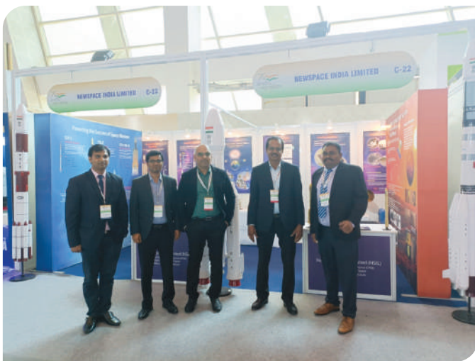
NSIL Exhibition Stall in Gandhinagar, Gujarat

CEO Certificate is attached with Report on Corporate Governance as Annexure A.