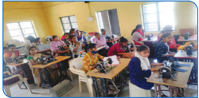
“Tailoring” Skill Development Program for rural girls of villages around Nagpur, Maharashtra