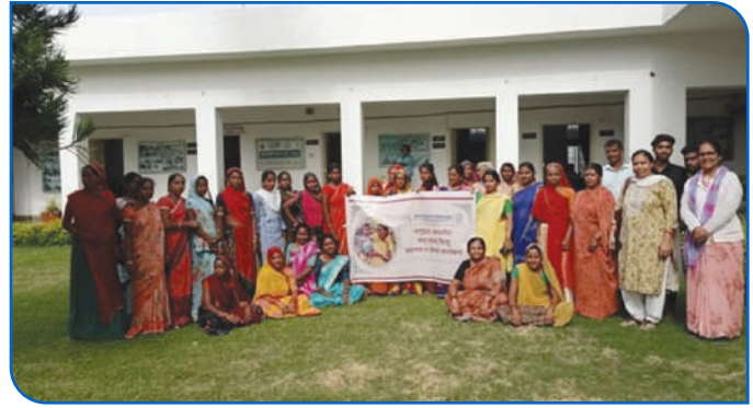
Anganwadi workers, ASHA workers and Balsakhis during capacity building on early childcare issues