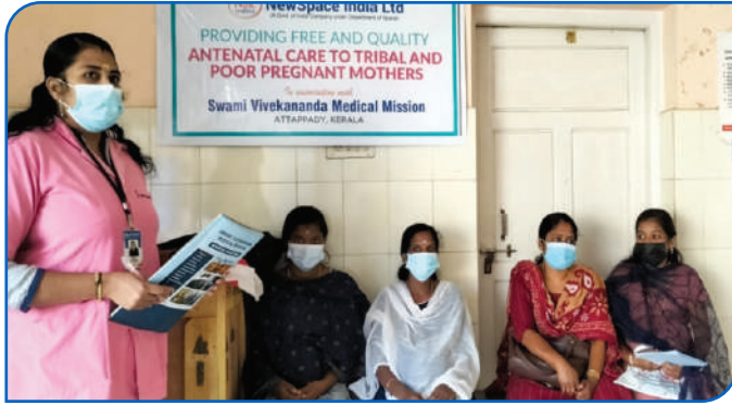
Antenatal Care of Tribal Mothers In Attappady, Kerala